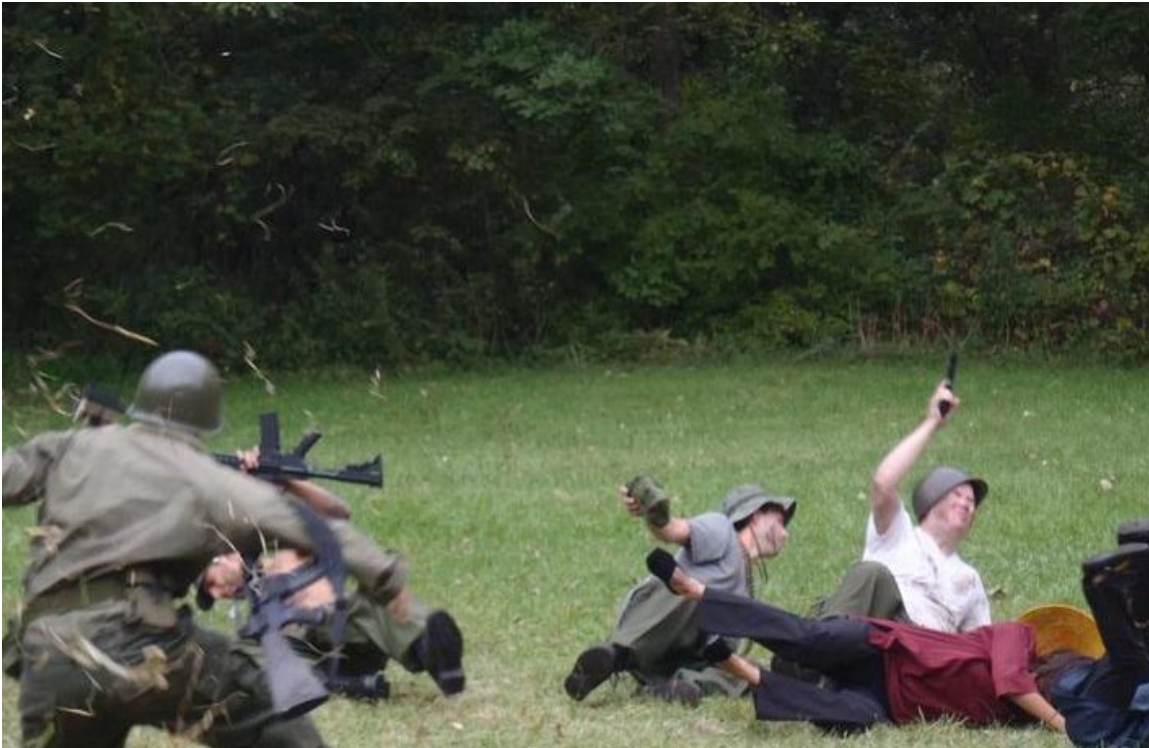
A scene from “Hearts Desire.”

“While our films may not necessarily be for everyone, we pledge to create high quality and profitable films that engage and entertain our audiences wherever they may be.”